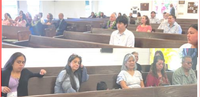
Saints gathered at the Hawaii Island Branch Church, celebrating its 56th Anniversary, Sunday, February 16, 2025.