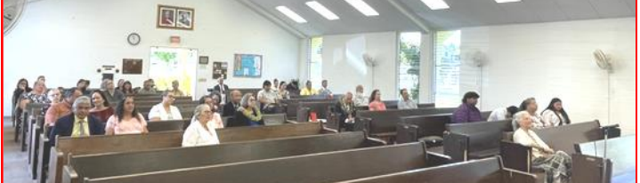
Saints who gathered from the neighbor Islands to celebrate the 56th Anniversary of the Hawaii Island Branch Church.